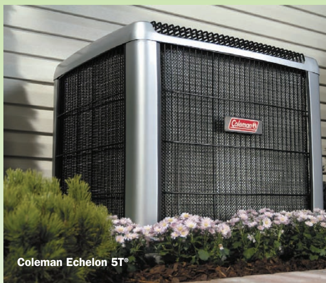
Coleman Echelon 5T®

This model's unique swept-wing fan design moves air smoothly off the blade with minimal turbulence to contribute to quieter operation from the system's exterior condensing unit. A two-stage compressor helps deliver uniform distribution of cool air within the home. Two-speed operation minimizes energy consumption during mild weather.